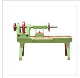
Spinning Lathe Machines