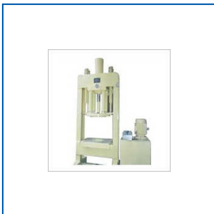
DEEP DRAW HYDRAULIC PRESSES

Bead Roller Machine, Beading Machines, Bowl Cutter Machine, Deep Draw Hydraulic Presses, Deep Drawing Double Action Power Press, Double Action Power Press, Heavy Duty Beading Machine, Hydraulic Power Press Machine, Industrial Beading Machine, Industrial Circle Cutter Machinery, Industrial Deep Drawing Double Action Power Press, Industrial Sanda Machine, Industrial Spinning Lathe Machine, Machine Repairing Services, Pneumatic Spinning Lathe Machine, etc.