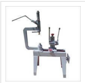
Industrial Beading Machine