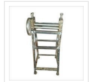
Bead Roller Machine