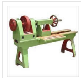
Industrial Spinning Lathe Machine