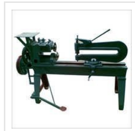
Industrial Circle Cutter Machinery