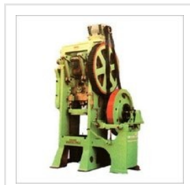
Double Action Power Press