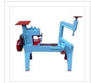
Bowl Cutter Machine