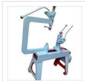
Heavy Duty Beading Machine