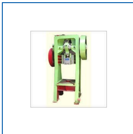
SINGLE ACTION POWER PRESS MACHINE