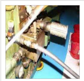
Machine Repairing Services