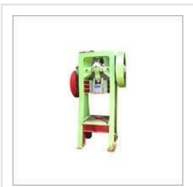
Hydraulic Power Press Machine