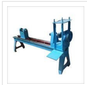
Pneumatic Spinning Lathe Machine