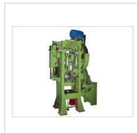
Industrial Deep Drawing Double Action